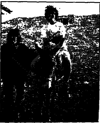
A different way to see the Negev